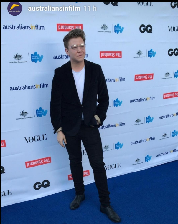
The Standard Hotel, HLS 2018