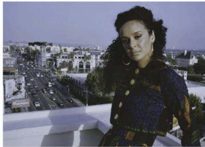
Vogue Magazine, December 2018