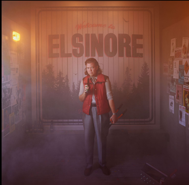
As Laertes in Because the Night