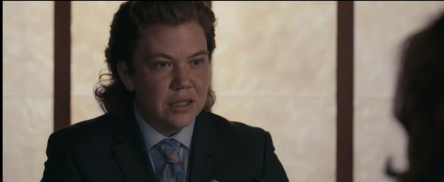
As Vincent in Love Me (Warner Bros.)